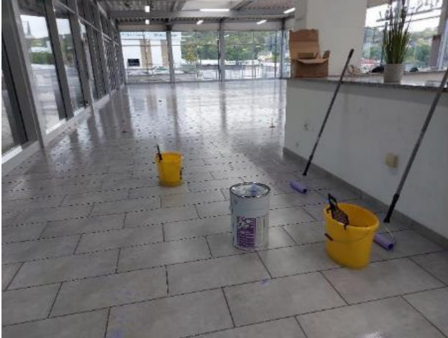
The craftsmen primed the old covering with PCI Gisogrund 404. ( Link to high-resolution photo )