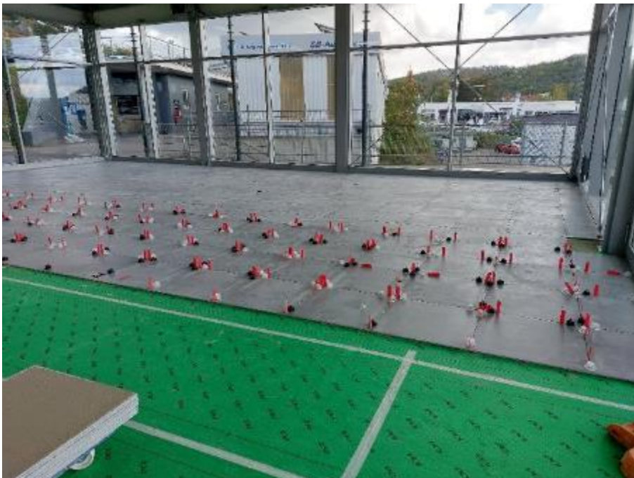
The craftsmen also used PCI Flexmörtel S1 Flott for bonding the tiles, and cementitious mortar PCI FT Megafug for grouting. ( Link to high-resolution photo )