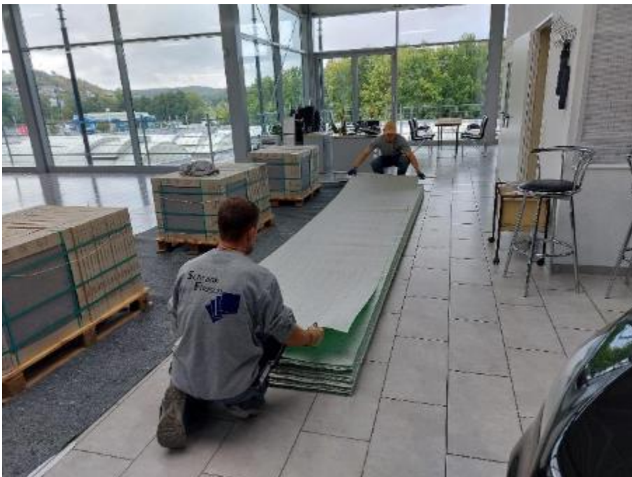
PCI Pecilastic E was used for isolation in accordance with the PCI installation recommendation. ( Link to high-resolution photo )