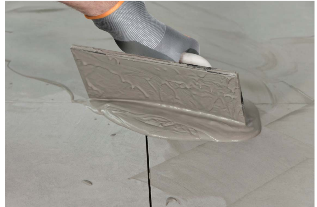
Fig. 6: PCI Nanofug Premium is very popular with project owners as the joints are easy to clean, resist attack by acidic detergents and offer effective protection against certain mould fungi and microorganisms.