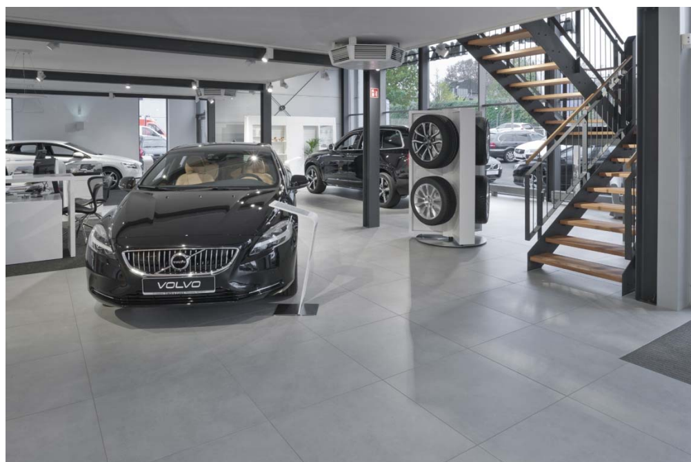
Fig. 7: The Finck und Claus car dealership in Pinneberg with its new design: the showroom, with its new floor covering made from large tiles, provides a high-quality modern environment for the display of vehicles.