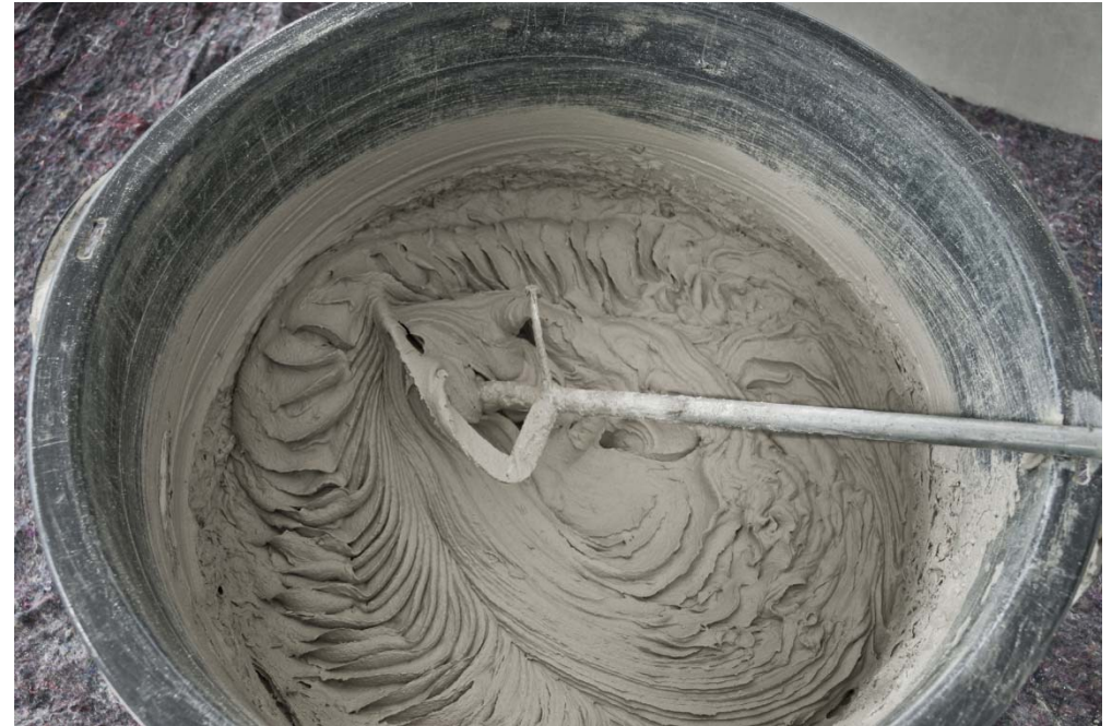
Fig. 4: PCI Flexmörtel S1 Flott is easy to process: just mix with water and stir to form a plastic mortar free from lumps using a suitable basket mixer. The mortar should be allowed to stand for about three minutes and then stirred again briefly.