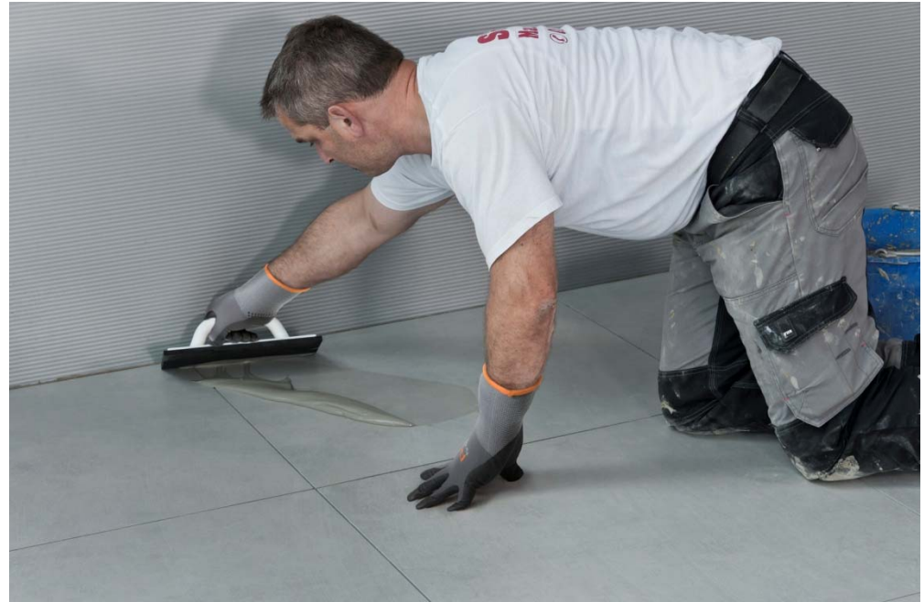
Fig. 5: The tilers used PCI Nanofug Premium for grouting the joints. This variable, flexible joint grout has a convenient working time of about 40 minutes.