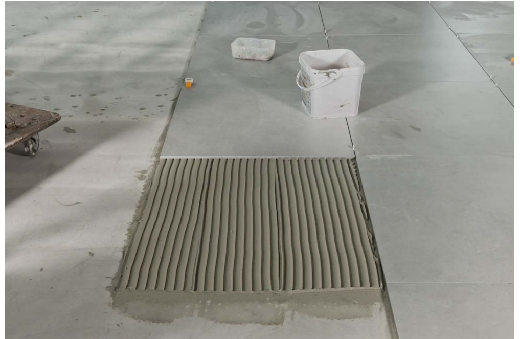
Fig. 2: The flexibility of the tile adhesive allows it to absorb stresses caused by the substrate and by temperature fluctuations.