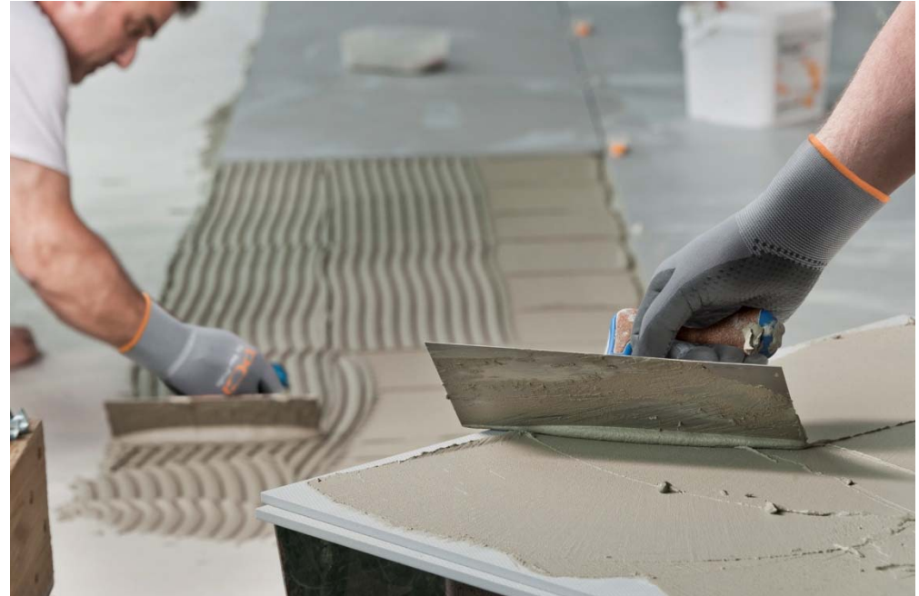
Fig. 3: PCI Flexmörtel S1 Flott allows rapid progress with work: it is only necessary to apply a scratch layer to the back of the tile (buttering-floating method), so that the tiles bond firmly to the substrate without any air bubbles or voids.