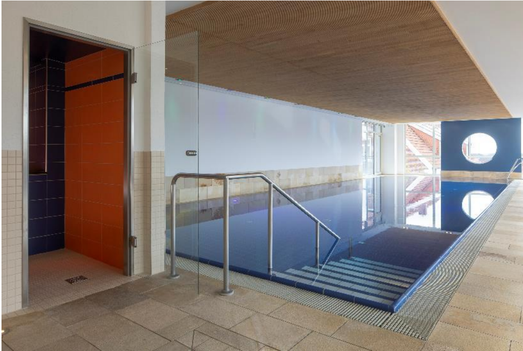
The work on the new steam bath was carried out while the bath was in operation. (Link to the high resolution Photo )