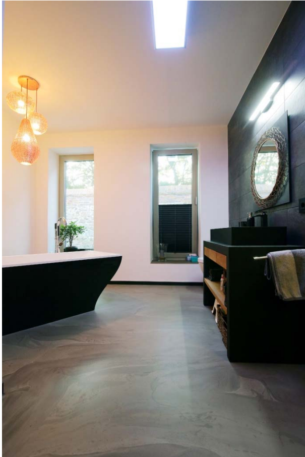
Fig. 3: The client wanted to create an exclusive floor which would adapt precisely to the requirements posed by the shapes of the individual rooms and connections to existing flooring. The very low-emission floor levelling compound PCI Periplan Multi also contributes to a healthy living environment.