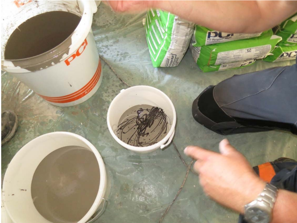
Fig. 5: The flowable cementitious floor levelling compound PCI Periplan Multi is easy to mix and tint with the MIXOL tinting paste. It can be applied simply by pouring onto the substrate.