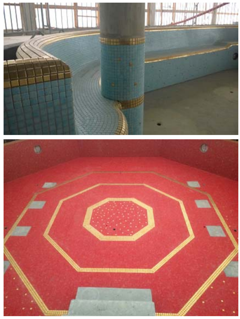
Fig. 7 and 8: The mosaic-lined pools of Kristall-Therme trimini create an exclusive and elegant impression. To ensure durable waterproofing, PCI Seccoral 2K Rapid fast-setting special waterproofing slurry was used.

Sitz der Gesellschaft: PCI Augsburg GmbH Piccardstraße 11, 86159 Augsburg Postfach 102247, 86012 Augsburg Tel. +49(821)5901-0 Fax +49(821)5901-372