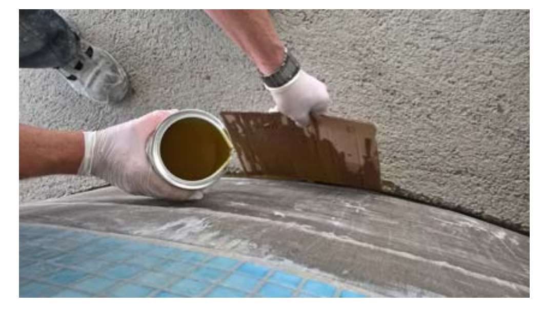
Fig. 6: Elastic grouting between the screed and the rising wall in the pool with PCI Apogel E.

augsburg.com/php/index.php?database=1&downloadimage=55472&size=3264x184 0&format=&time=1555538399&check=0f1a8a7fe79d05ac1d5b10a81f289972