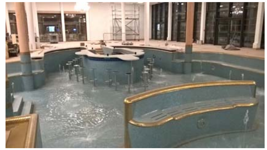
Fig. 11: Ready for the water. The tiling in the pool bar has been laid and grouted. Thanks to PCI Seccoral 2K Rapid, the substrate is absolutely watertight.