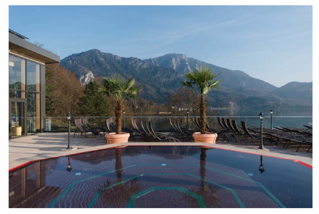
Fig. 1: Kristall Bäder AG has refurbished the Kristall trimini family spa on the banks of the Kochelsee and added a magnificent wellness oasis – using PCI waterproofing and tiling products.