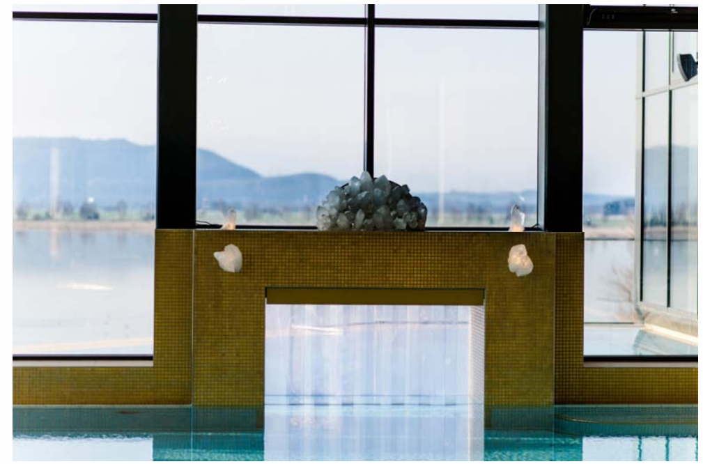
Fig. 12: The alterations and extensions were completed in 21 months and Kristall trimini was opened to schedule in March 2017 – a high-grade spa with "the very best" equipment and systems, according to Günter Beckstein.