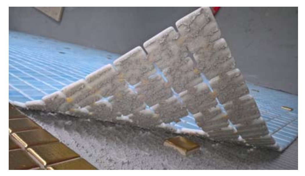
Fig. 5: For the laying of the mosaic tiling, the substrate was first levelled with PCI Pericret. The tiles were laid using PCI FT Klebemörtel mixed with PCI Lastoflex polymer-modified additive. In the soda pool, PCI Durapox NT plus reaction resin mortar was used for laying the glass mosaic tiling on glass-fibre-reinforced plastic waterproofing.

augsburg.com/php/index.php?database=1&downloadimage=55471&size=7360x491 2&format=&time=1555538399&check=eb678bcbe2232b34ec2f2fe2f1c8c7cd