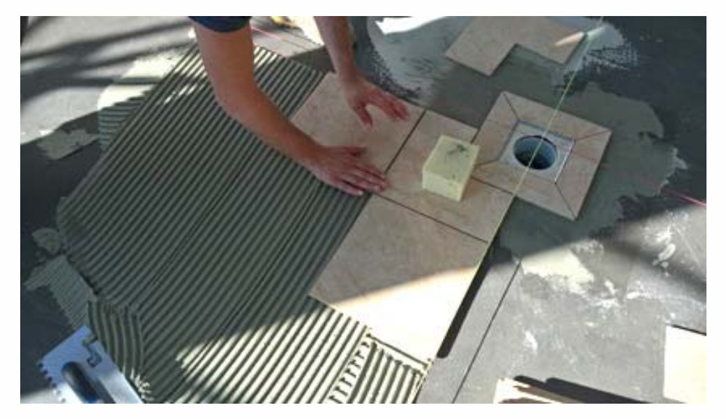
Fig. 9: The anti-slip tiling on the pool surrounds and in showers and changing rooms was laid using PCI FT Klebemörtel thin-bed adhesive with PCI Lastoflex polymer-modified additive.

augsburg.com/php/index.php?database=1&downloadimage=55475&size=1600x120 0&format=&time=1555538399&check=1dc5c3a4480e18f5803ba24987e7de52